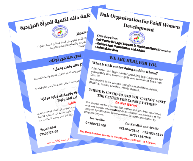
This flier was developed to advertise the availability of legal support in the midst of COVID-19 to women and girls in the Ninewa Plains in Iraq.

by working with women and girls to improve livelihoods, provide legal advocacy and gender-sensitive negotiation, and incorporate mental health and psychosocial services (MHPSS) in primary health care. MSI can also provide training and technical support to mental health service providers so they can remotely help women and girls unable to leave their homes during the pandemic while ensuring their confidentiality.