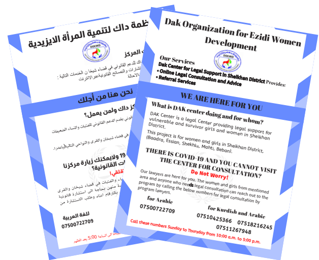
This flier was developed to advertise the availability of legal support in the midst of COVID-19 to women and girls in the Ninewa Plains in Iraq.

by working with women and girls to improve livelihoods, provide legal advocacy and gender-sensitive negotiation, and incorporate mental health and psychosocial services (MHPSS) in primary health care. MSI can also provide training and technical support to mental health service providers so they can remotely help women and girls unable to leave their homes during the pandemic while ensuring their confidentiality.