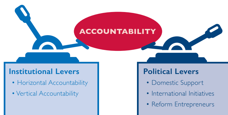
FIGURE 2 Levers of Accountability

The second white paper in this series focuses more extensively on the complex topic of state complicity.